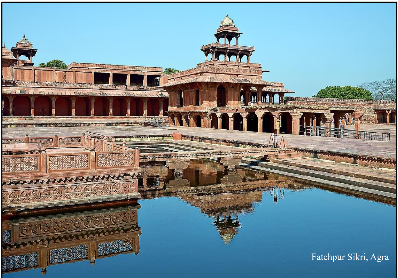
Fatehpur Sikri, Agra

Day 3: Agra - Fatehpur Sikri – Jaipur: Distance (254 kms | 5 ½ hrs)